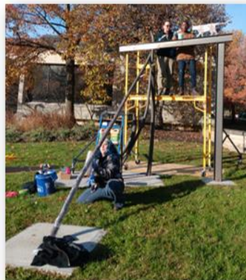
Blind Eye Restoration working on Dingle and Egeria