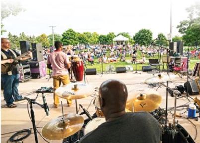
26 | UPPER ARLINGTON ARTS AND CULTURE MASTER PLAN