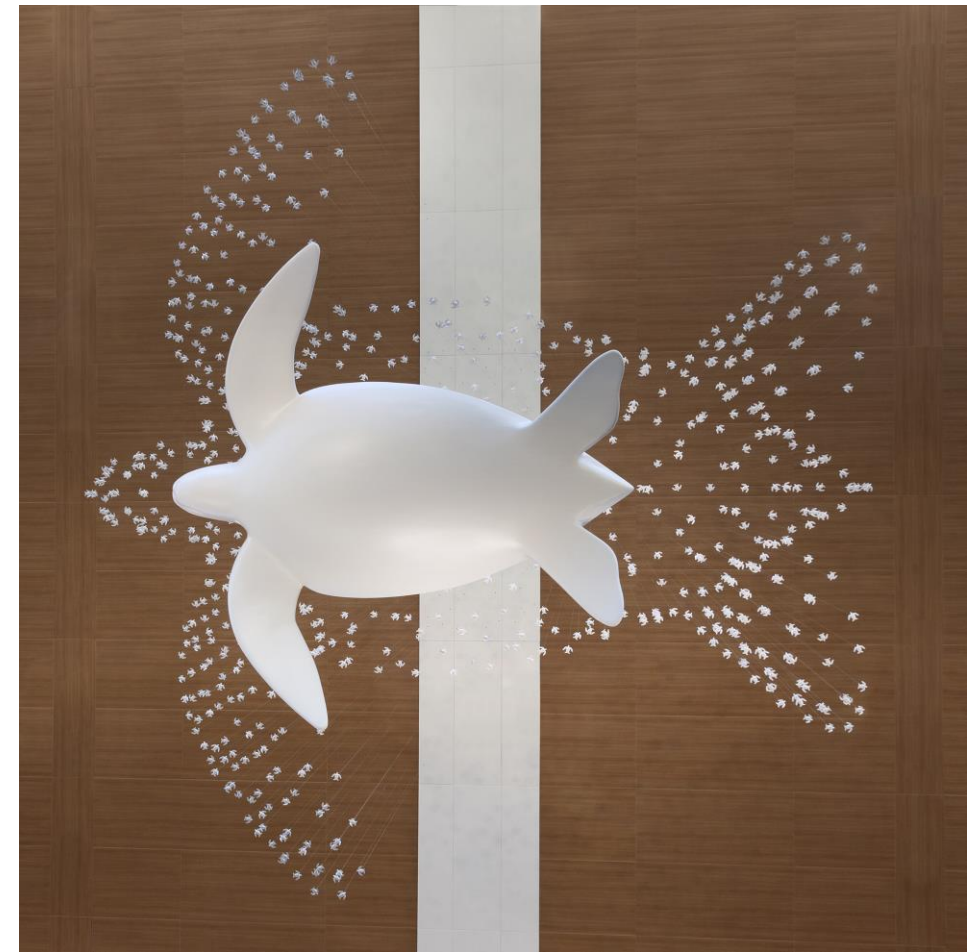
N + 1 by Ralph Helmick Tampa International Airport, FL 2018 Budget: unknown