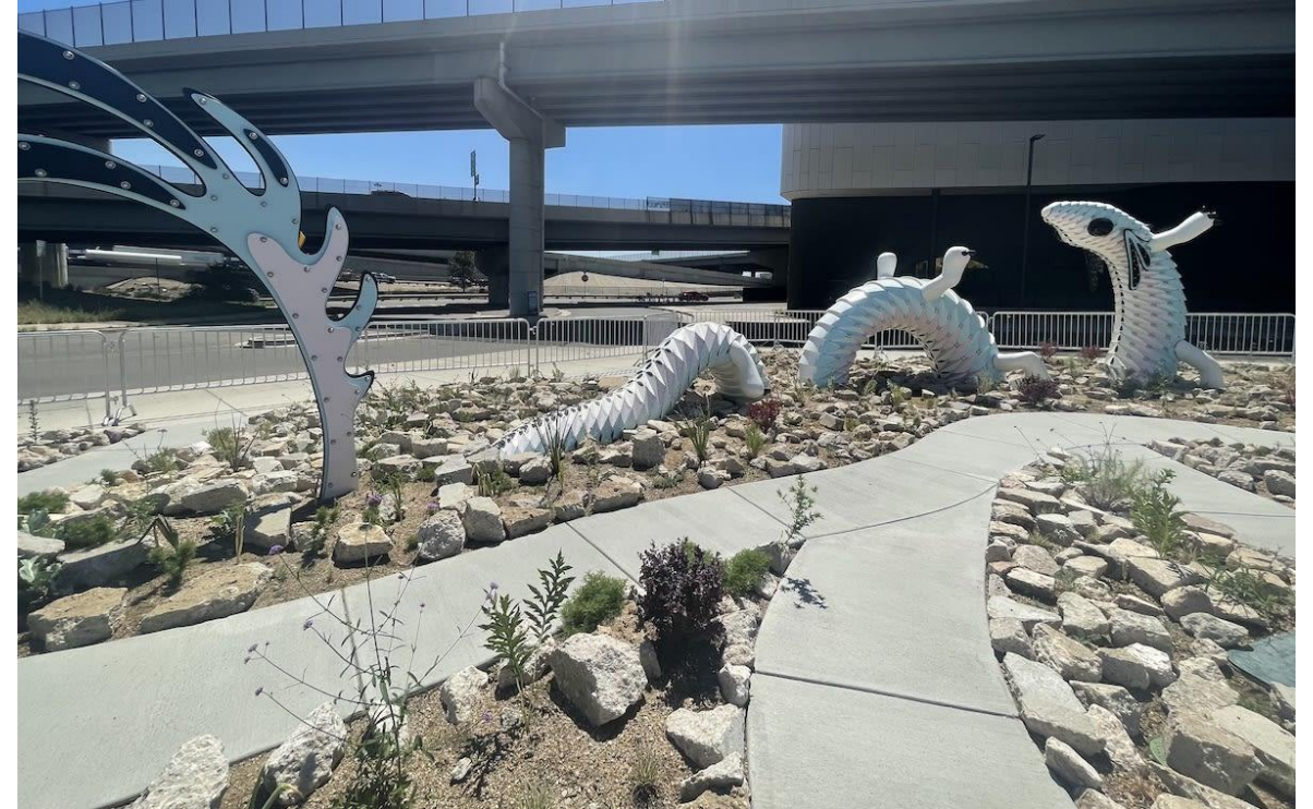
Plethodon by Demiurge, LLC Denver, CO 2020 Budget: unknown