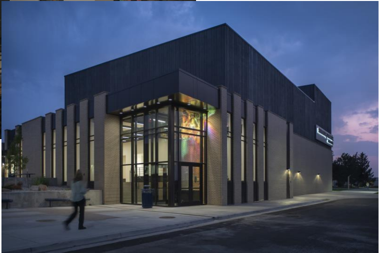
Optical Play by Design Studio GH, LLC Surbrugg-Prentice Auditorium Building, Laramie County Community College, Cheyenne, WY 2021 Budget: $65,000