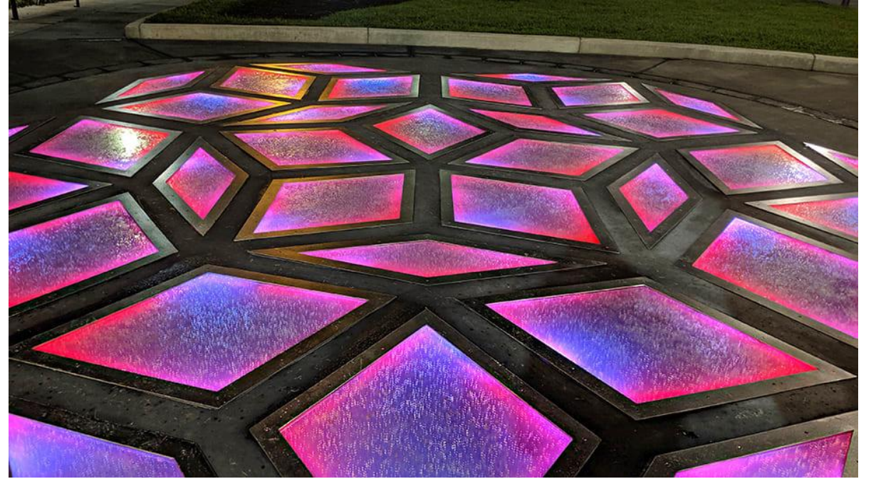
Euclid by Jen Lewin Norwalk, CT 2018 Budget: $250,000