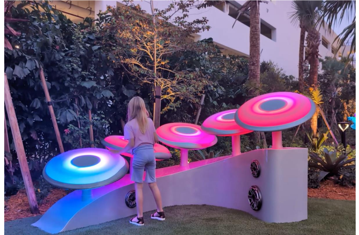
Myco by Jen Lewin Doral Pocket Park, FL 2024 Budget: unknown