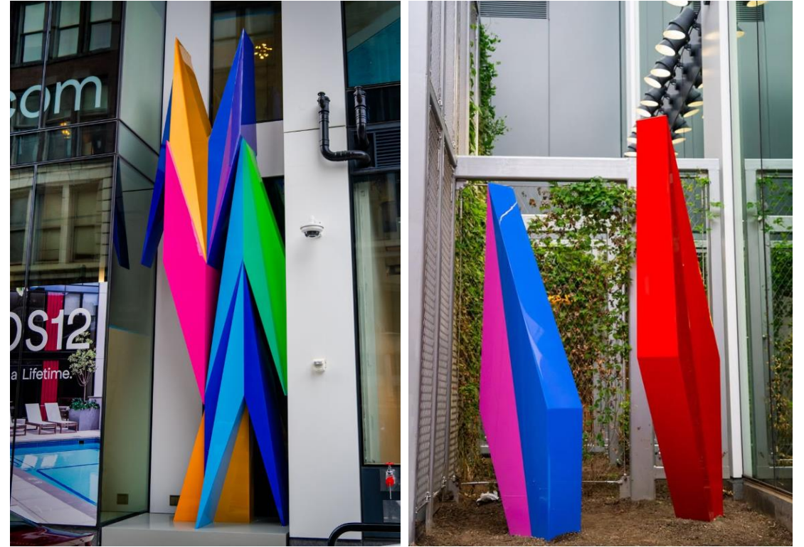
Free Forms by Odili Odita 210 South 12 th , Philadelphia, PA 2025 Budget: unknown