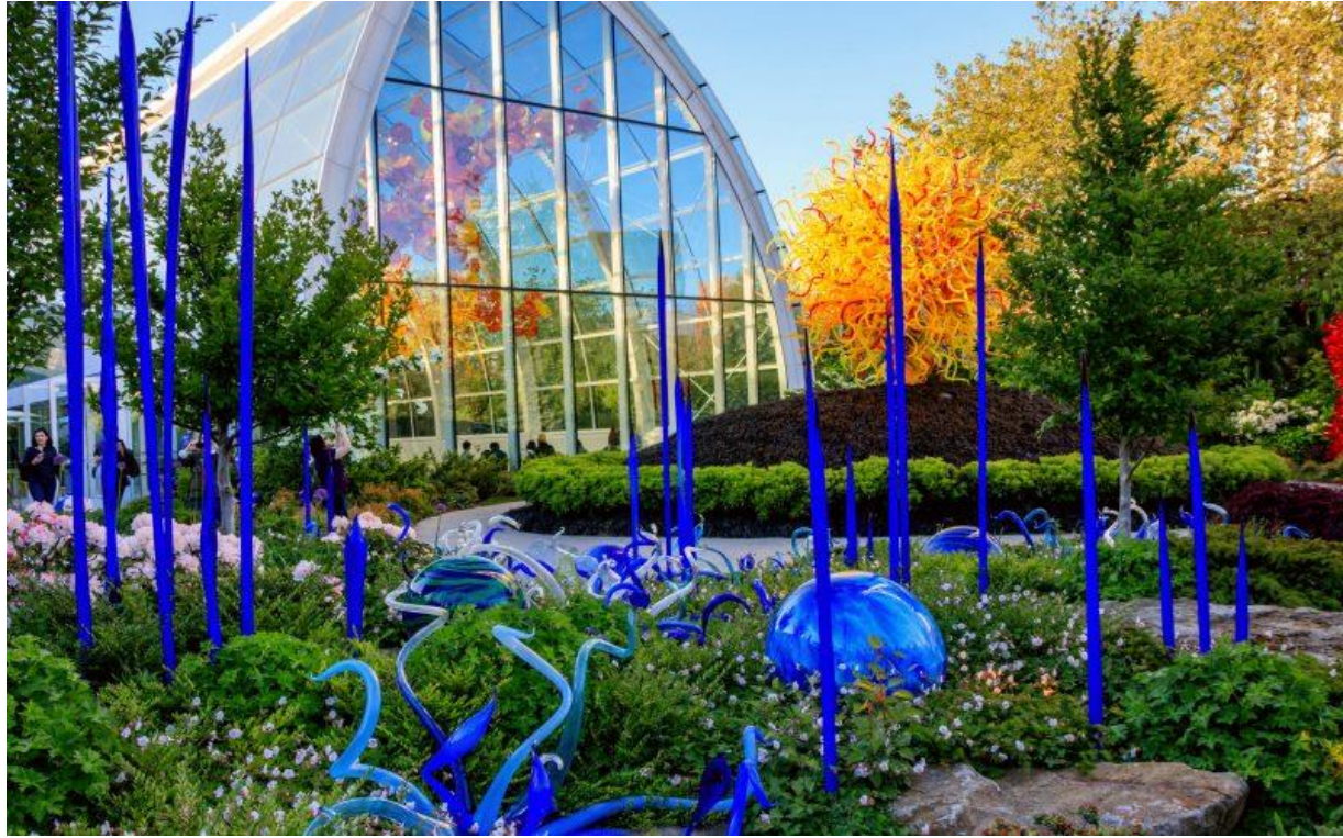
Untitled by Dale Chihuly Chihuly Garden and Glass, Seattle, WA 2012 Budget: unknown